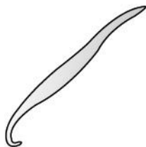
Hookworm (5x actual size)

Since the dog's environment can be infested with hookworm eggs and larvae, it may be necessary to treat with chemicals to remove them from your yard. We can offer recommendations for grass-friendly products.